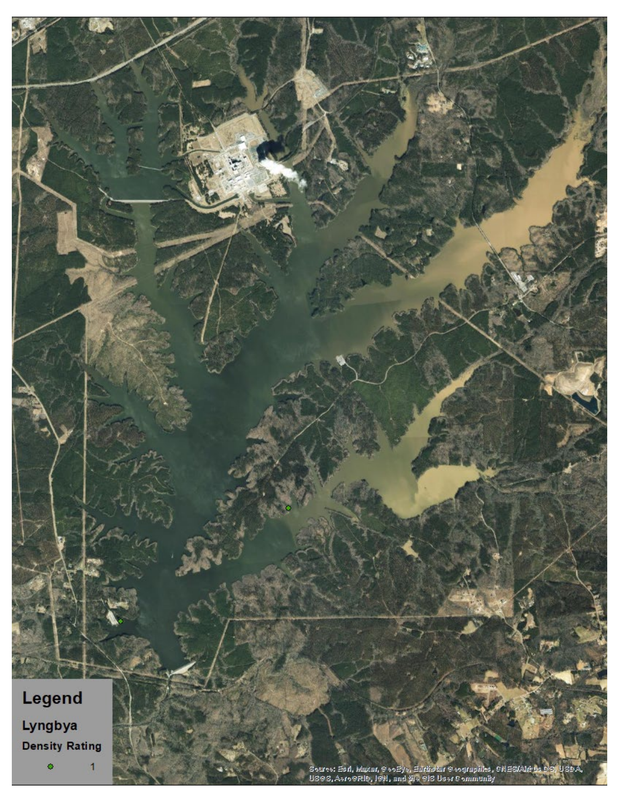
Figure 2. Map showing location and density rating of Lyngbya.